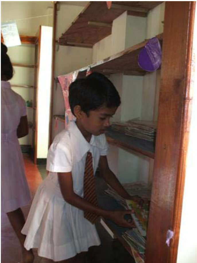
The children have never had so many books to choose from.