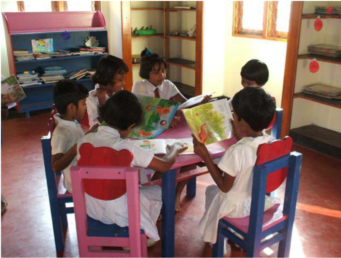
The students can't wait to read their favorite books.