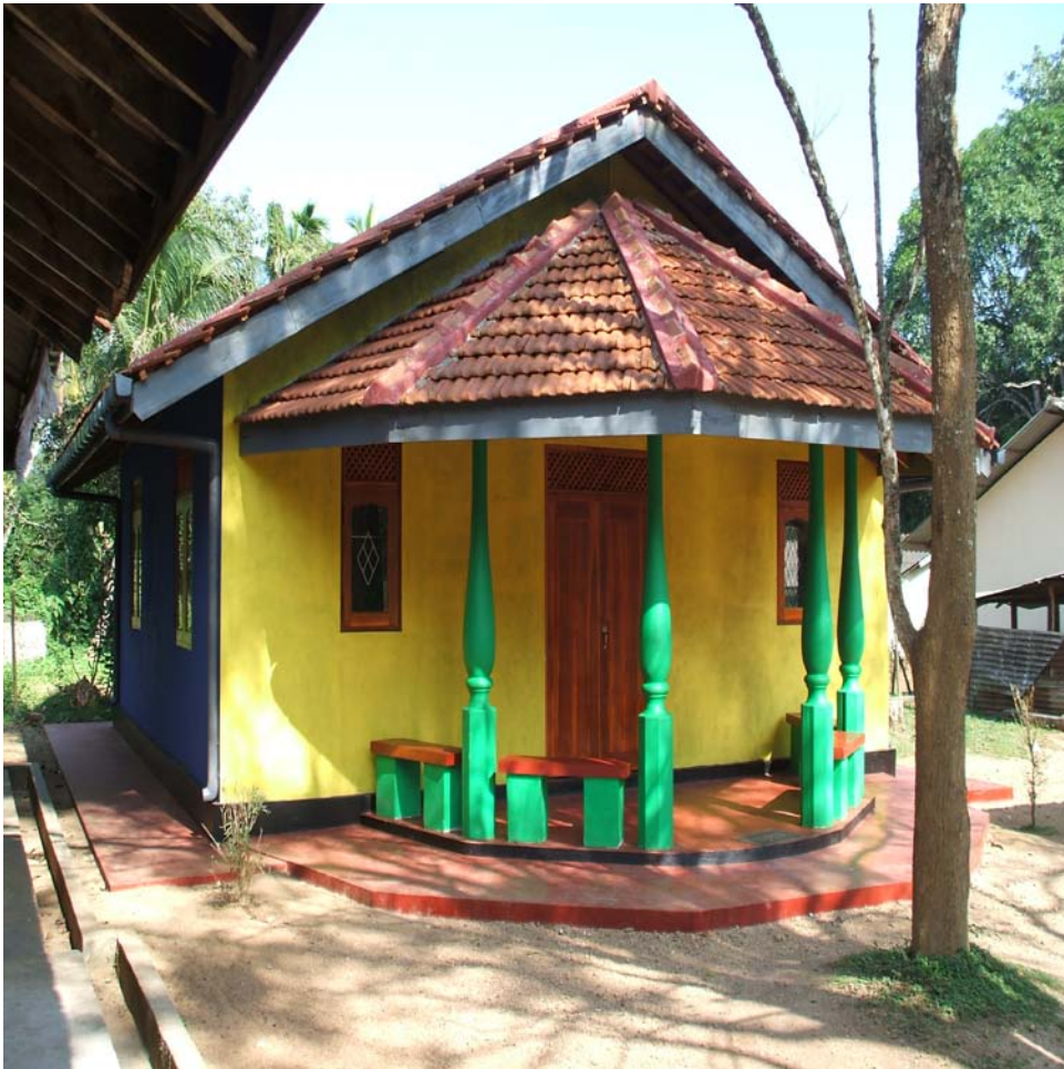
The Constructed Reading Room is painted yellow, green, and blue.