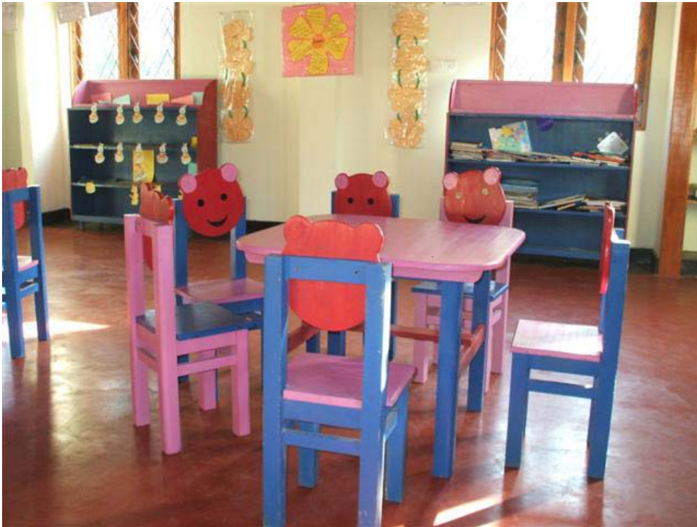
Room to Read provided colorful furniture, books, and educational materials.