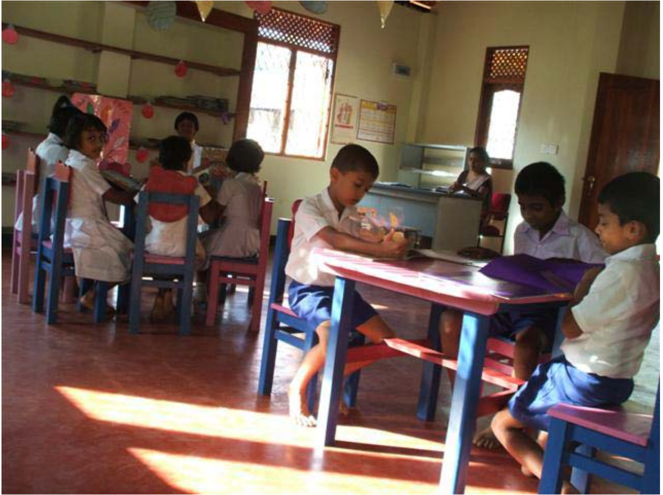
The Constructed Reading Room has an open area in which the children can gather.