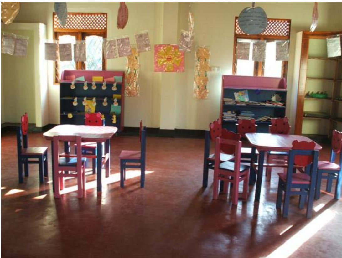
The interior of the Constructed Reading Room is filled with light.