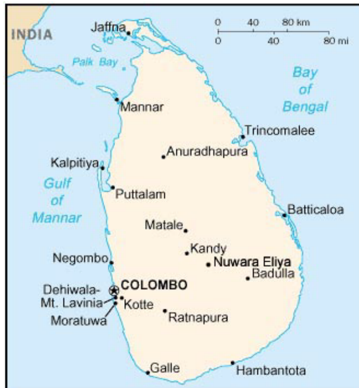
Map of Sri Lanka.

Narrow, windy, and bumpy roads in poor condition limit travel to this region. Although the trip is beautiful, the drive from Colombo takes 6 hours.