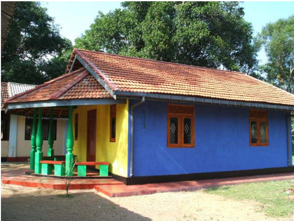
The Constructed Reading Room is an attractive addition to this community.